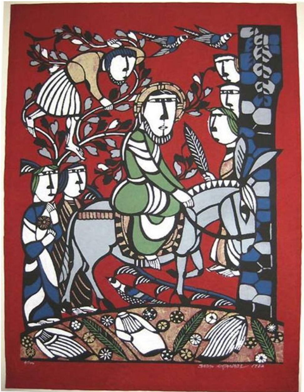
Entry Into Jerusalem by Sadao Watanabe