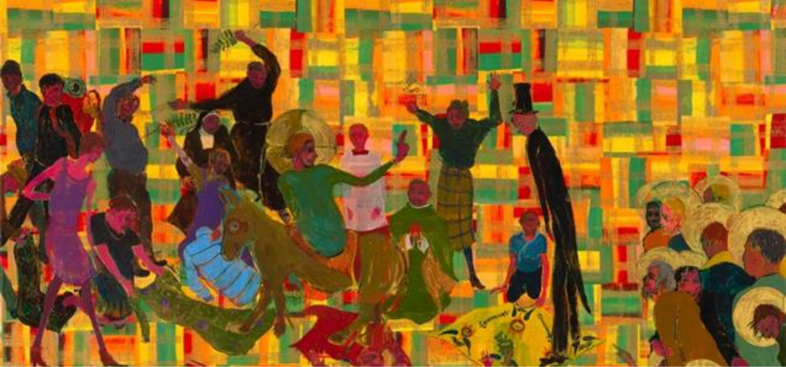
Palm Sunday by Kai Althoff